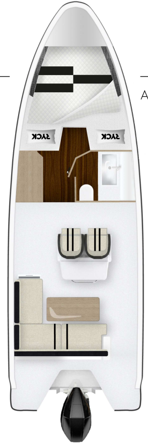
OPTION Cabin & Head